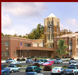
View of new addition of school from Grand Ave. & 44th Ave W.