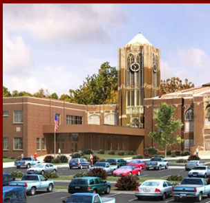
View of new addition of school from Grand Ave. & 44th Ave W.

Tickets are $15.00 in advance and $20.00 at the door. Advance tickets may be purchased at Super One Liquors or from any Alumni Board Member.