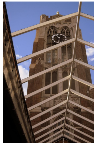
The view off the clock tower as you enter through the new front entrance

The newly renovated Denfeld High School opened its doors to students on September 8th, 2011. Most have been very pleased with the combination of our traditional architecture and the new additions. The tower, panel lobby, and auditorium live on, as beautiful and cool as ever; enough said. The most talked about addition is the view of the tower as you enter the school. To keep up with the technological savvy generation of our current students, many of the classrooms have incorporated Smart Boards, a replacement for the classic black boards. These interactive, internet-compatible whiteboards project the teacher's computer screen to experience endless resources for learning.