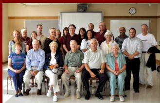
Above: Denfeld VIP Tour attendees

“The VIP Tour was a moving and memorable experience”